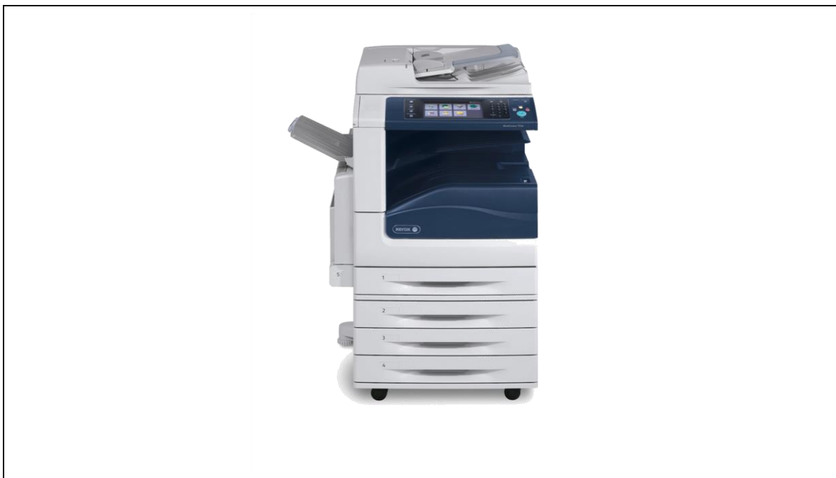
Figure 1: Xerox® WorkCentre® 7845/7845i/7855/7855i 2016 Xerox® ConnectKey® Technology

The TOE can integrate with an IPv4 network with native support for DHCP. The hardware included in the TOE is shown in the figure below.