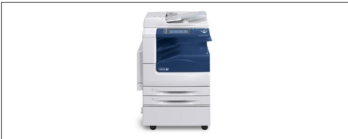
Figure 1: Xerox® WorkCentre® 7220/7220i/7225/7225i 2016 Xerox® ConnectKey® Technology

The TOE can integrate with an IPv4 network with native support for DHCP. The hardware included in the TOE is shown in the figure below.