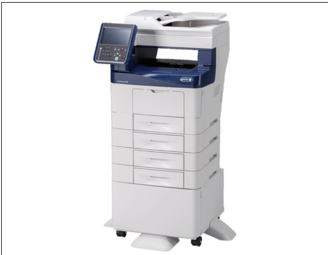
Figure 1: Xerox® WorkCentre® 6655/6655i 2016 Xerox® ConnectKey® Technology

The TOE can integrate with an IPv4 network with native support for DHCP. The hardware included in the TOE is shown in the figure below.