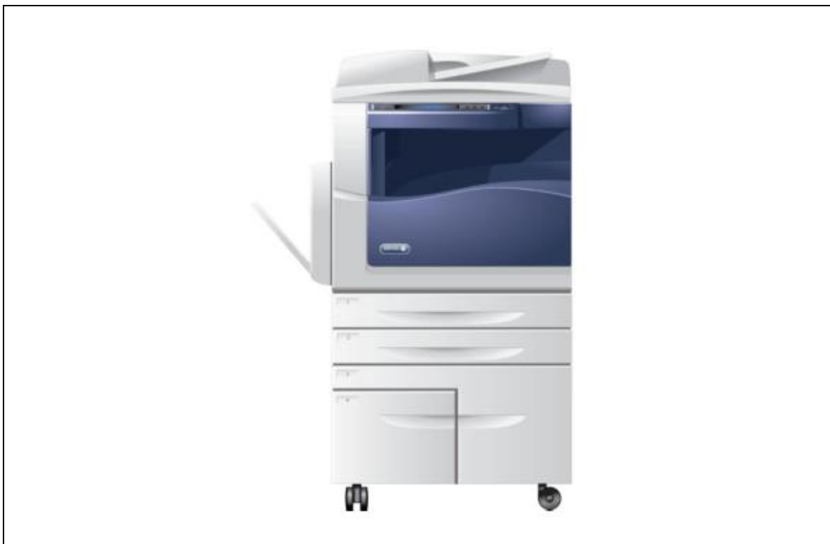
Figure 1: Xerox® WorkCentre® 5945/5945i/5955/5955i 2016 Xerox® ConnectKey® Technology

The TOE can integrate with an IPv4 network with native support for DHCP. The hardware included in the TOE is shown in the figure below.