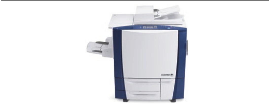
Figure 5: Xerox ColorQube 9301/9302/9303 ConnectKey 1.5 Technology

Table 2 below shows the various models and capabilities of the TOE. The models vary in printing speed, paper capacity and available finsher options.