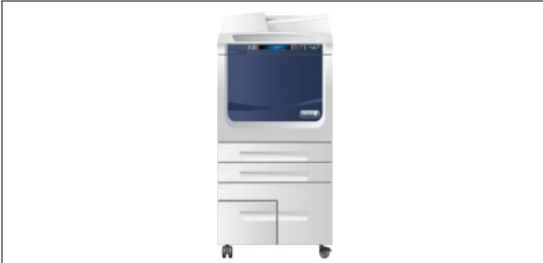
Figure 1: Xerox WorkCentre 5845/5855/5865/5875/5890

The TOE can integrate with an IPv4 network with native support for DHCP. The hardware included in the TOE is shown in the following figures.