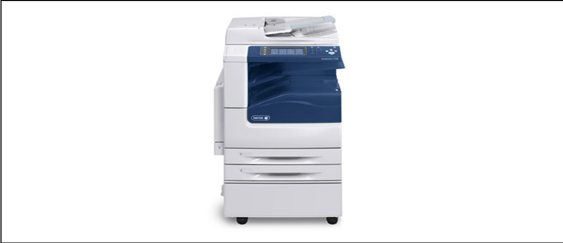
Figure 2: Xerox WorkCentre 7220/7225