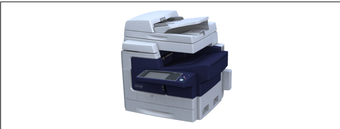
Figure 4: Xerox ColorQube 8700/8900 ConnectKey 1.5 Technology