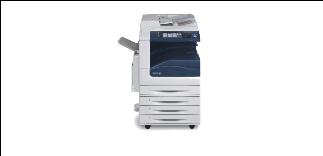
Figure 3: Xerox WorkCentre 7830/7835/7845/7855